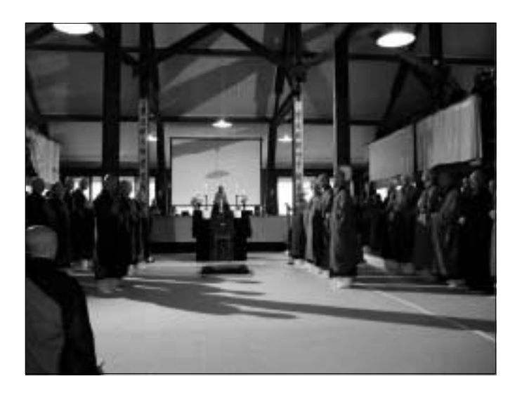
Memorial Service at Fortieth Memorial Celebrations of Soto Zen teaching activities in Europe