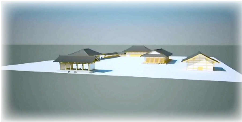
The Rendering of Tempyozan Zendo