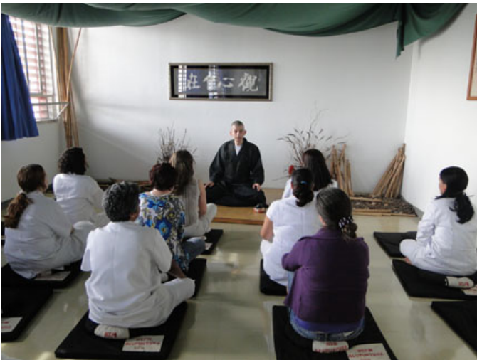
Zazen Practice at hospital

Many times people have no idea of what meditation is nor have they heard about zazen. Many have pain in body or mind that keeps them from stillness even for a short while. First they need to speak about their anguish and heartaches. They tell of life stories and family conflicts.