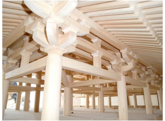
Model of Buddha Hall

I would like to ask all of you to understand the value of Tempyozan Zendo and to help us accomplish this great, epoch-making project successfully. I really appreciate your support and cooperation .