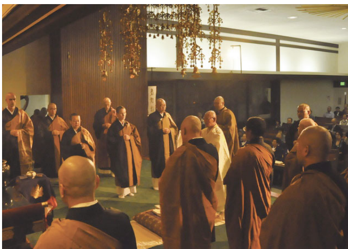
Ceremony Commemorating the 90th Anniversary of Sotoshu Teaching Activities in North America

Let me end with "Happy Birthday!" Congratulations to Zenshuji on its ninetieth anniversary. Thank you.