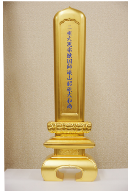
Gasán Joseki Zenji's Memorial tablet

Theme of Great Memorial Ceremony for the 650th Anniversary of Daihonzan Sojiji's Second Abbot Gasán Joseki Zenji