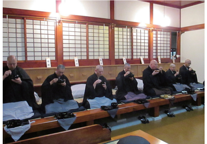
Oryoki meal for breakfast at Sodo

I forget everything I thought I knew. I stand in front of the moppa n and I think, 'Was it one hit or two? One or two? One or two?' So, I ask my friend, 'One or two?' and he says 'I thought it was three!' And I think: 'Ok, three.' And I hit: One, two, three. And then a teacher comes running, saying 'Noooooooo!' And I think: 'Ohhh nooooo!!!!'"